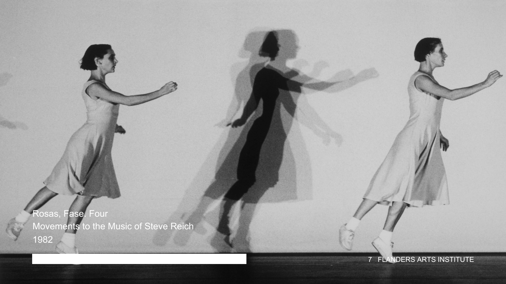
Rosas, Fase. Four Movements to the Music of Steve Reich 1982